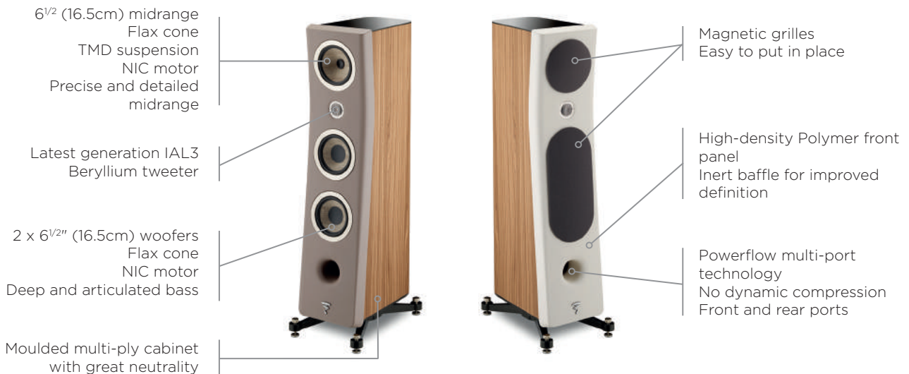
Kanta N°2, Walnut cabinet, Matt Warm Taupe and Ivory front panels

Kanta N°2 is a three-way floor standing loudspeaker totally dedicated to performance. Kanta N°2 is equipped with a new generation IAL tweeter featuring a Beryllium inverted dome and Flax sandwich cone speaker drivers. This is an unprecedented combination of technologies to guarantee precise, detailed and warm sound. Focal's latest acoustic innovations have been integrated into these floorstanders encompassing a modern and distinctive design. These loudspeakers are perfect for rooms measuring up to 320ft 2 (30m 2 ) and they're also ideal for larger rooms of up to 750ft 2 (60m 2 ).