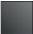
Black High Gloss